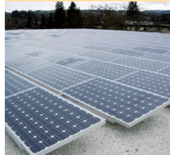
The NU-U235F1 offers industry-leading performance for a variety of applications.

156 mm monocrystalline solar cells provide high power output. Ideal for large commercial rooftops where space is a premium.