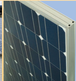
Improved Frame Technology