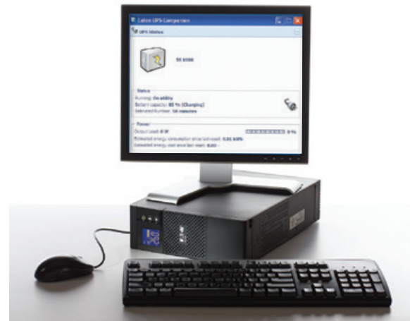
The 5S fits in small spaces and can also be used as a monitor stand.