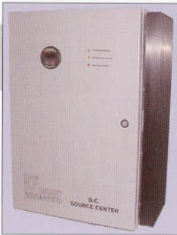
48 V unit, with optional E-Meter