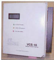
240 V unit