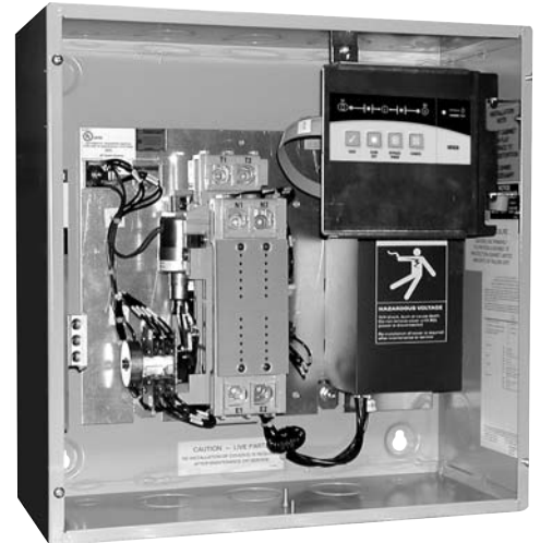
ZTX Series Residential & Light Commercial Switch with LED Control Panel (cover removed)